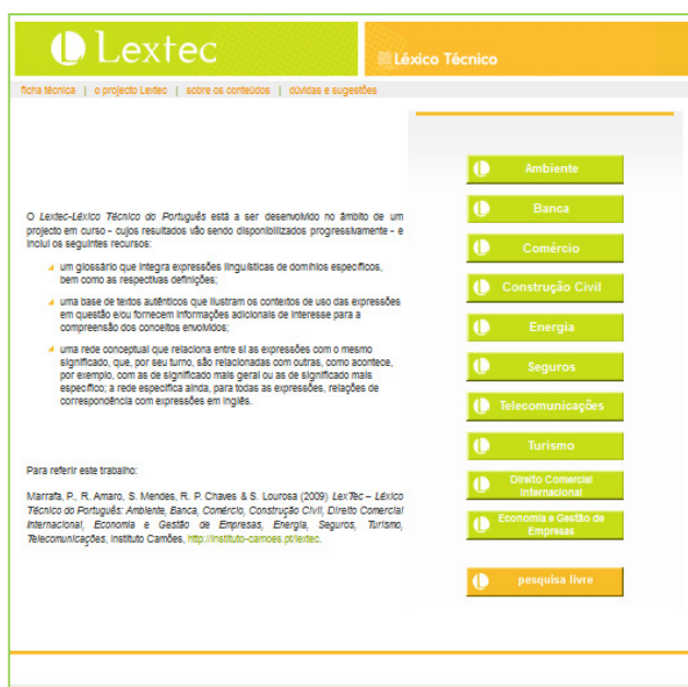
Figure 1: Homepage of the LexTec web interface, in which the user can selected for one of the technical domains available or opt for a free term search in the entire database

The web interface for navigating LexTec database has been designed to allow for the visualization of all the information encoded. Working on top of an SQL database, this web interface allows for searching information per domain as well as per string (i.e. per term), as shown in Figures 1 and 2. It also allows for visualizing all the terms in a domain as a list (see Figure 2).