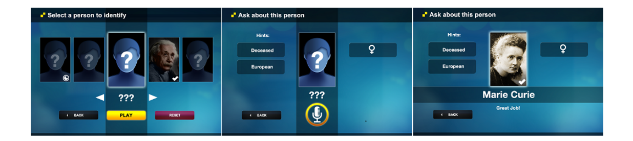
Figure 2: DBOX Quiz game interface