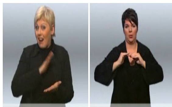
Figure 2: Pronunciation Variants of Sign GLATT (slippery)

Although the videos of the RWTH-PHOENIX-Weather corpus have not been recorded under lab conditions, the TV station tries to control the lighting conditions and the positioning of the signer in front of the camera. Additionally, signers wear dark clothes in front of a grey background. All videos have a resolution of 210 \times 260 pixel and 25 frames per second (FPS). Figure 1 shows example images of all seven signers (six women and one man) present in the RWTH-PHOENIX-Weather corpus as well as the distribution of the signers in the overall corpus. One of the challenges of the RWTH-PHOENIX-Weather corpus is the signing speed, which in combination with the low temporal resolution of 25 FPS leads to motion blur effects. Furthermore, the signing itself has been performed by hearing interpreters under real-time constraints. This gives rise to two issues. First, the structure of the signing is closer to the