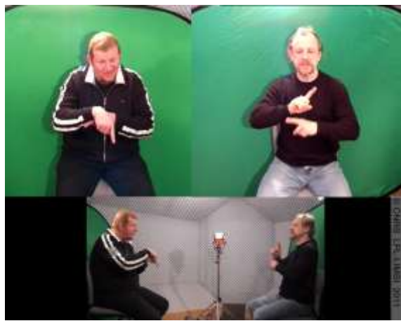
Figure 1: Excerpt from DEGELS1 corpus for French (top) and LSF (down).

DEGELS1 corpus has been registered in the Speech & Language Data Repository (SLDR) managed by the LPL, which provides services for sharing linguistic data (primary data, annotations, tools, etc.) and archiving it. The corpus is referenced in international repositories such