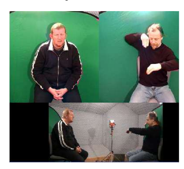
Figure 3: Frame extracted from DEGELS1 corpus, showing a depicting structure in LSF, which represents a description of the way a car moves in a sloping road.

After having asked the informant about his intent in this sequence, it was established that the gesture doesn't seems to own a pointing function. That reflects the fact that a precise description of the objective criteria used to select categories can help to choose the good one.