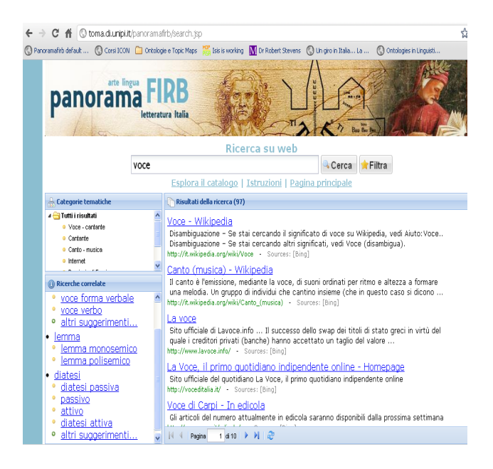
Figure 3: Example of query refinement from query "voce"

In figure 3 we show the suggested queries retrieved by the initial query "voce", term which in linguistics is polysemous: