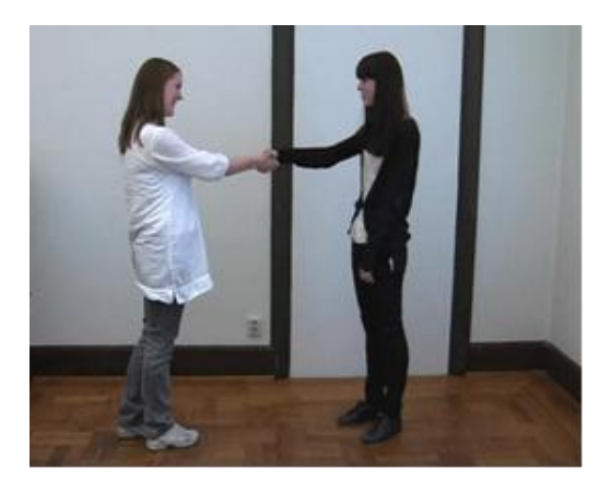
Figure 3: The total view of a Swedish video

So far 16 recordings of the Swedish video corpus have been transcribed using GTS, Gothenburg Transcription Standard (Nivre, 2004) and MSO 6, Modified Standard Orthography for Swedish (Nivre, 1999).