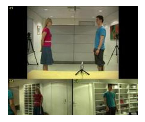
Figure 2: Mosaic view of one Finnish video

entered the recording space where the other one was already waiting. Three cameras were used to record the two participants separately and both together. From the three video recordings a mosaic version was also produced so that it is possible to follow each participant individually and both together on one video. Figure 2 shows the mosaic view of one of the videos.