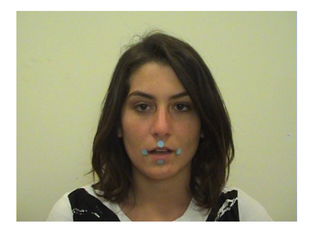
Figure 2: Sample frame from a recording showing the subject with a colored dot marking on the lips.

To test the audio-visual speech recognition (Dupont and Luettin, 2000) results on the collected data as compared to the M2VTS database (Pigeon and Vandendorpe, 1997), we have used a small subset of the data where the subjects count digits from zero to nine. The motivation behind selecting this subset is to have a constant word sequence across all videos like the M2VTS database. We have selected videos recorded in three terms (2008-2009 (1), 2008-2009 (2) and 2009-2010 (1)) all of which have three sessions. The results are obtained by selecting first