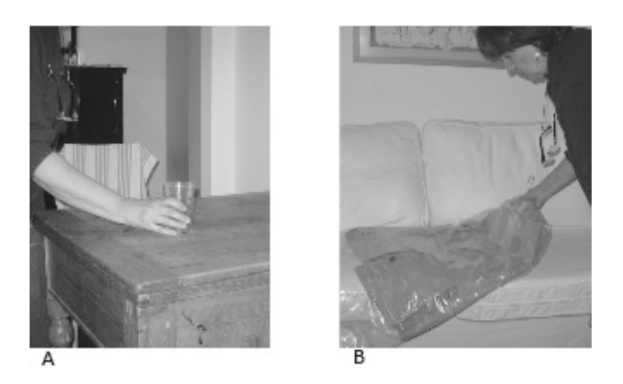
Figure 5. Competence based Extension of Action ontology

Therefore, a new type will arise in the database as a result of this language-specific categorization. The new prototypic scene in Figure 5B will be generated.