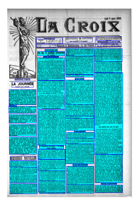
Figure 3: Block selection in a page (selected blocks are in blue, the user has deselected titles and headers).

Given a whole newspaper page, this tool links the picture of the page with its corresponding OCRed text in XML format. As outlined above, both picture and text are segmented by the OCR process into segments of various sizes (a word, a sentence, a paragraph). This tool generates separate images for each selected block and one file containing recognized text segments corresponding to each block. Initially, all text segments are selected: the user simply needs to click on irrelevant segments to deselect them. Finally, a file composed of those text segments that were kept selected (blue blocks on figure 3) is produced by this tool. Named entity annotations will be performed on this output text file.