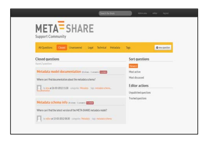
Figure 2: META-SHARE User Forum

Building on a report ("CLARIN Standardisation Action Plan") first put together by the CLARIN preparatory phase project (www.clarin.eu) together with FLaReNet,