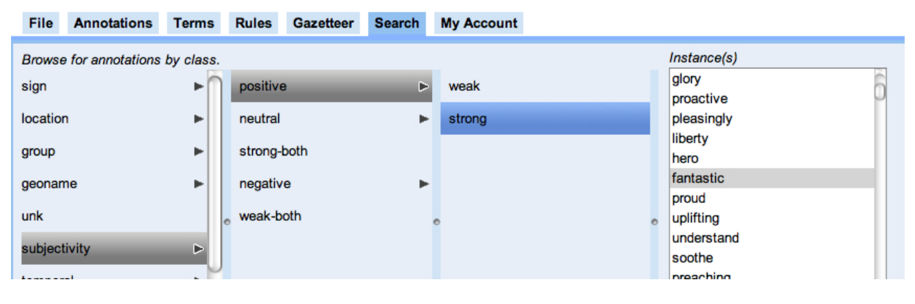
Figure 3: Annotation search by class and instance browsing

are placed in whichever 'directory' is currently open. Files of extension .gaz are treated as gazetteer files, and become part of the dictionary used for named entity-style analysis. The format of .gaz files is outlined in the on-line system documentation. In addition to uploading already compiled gazetteer files, the system allows the user to add and amend individual entries. Files of type .rul are context-sensitive syntactic/semantic rules that allow the creation of annotations on the basis of the satisfaction of feature constraints on their daughters, and if desired, on contextually adjacent text units. Twitter data is obtainable not as single files per text, but in the form of CSV files, in which the text column is complemented with metadata including the date, sender, sender profile, geo tag, etc. Web Cafeteire does not currently provide a facility to automatically upload such a file and split it into individual messages, but a batch update was conducted. For ease of reference in the interface, each distinct send date was placed in a directory of its own. For the analysis of the AV twitter corpus, we have concentrated initially on sentiment analysis, based initially on the MPQA sentiment lexicon (Wilson et al., 2009). The sentiment lexicon has been converted to the Cafetière .gaz format and this has been augmented with rules to take some account of context.