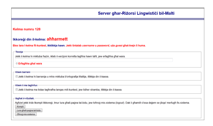
Figure 1: Web interface for the spelling correction tool

unicode-compliant Maltese characters (for example, a word like ħaġa 'thing/object' might be written as haga). This is a common problem with legacy data in Maltese produced prior to the widespread introduction of the unicode standard. Second, there is widespread variation among authors on the spelling of borrowed words. While some of these are well established and now have a 'Maltese' spelling (e.g. futbol 'football'), several others are either spelt using the original foreign (often, English) spelling, or adapted to Maltese orthography on an ad hoc basis. This is a situation which is expected to be rectified to some extent in the near future, given the recent publication of a set of guidelines for the spelling of foreign borrowings in Maltese. Finally, there are of course spelling errors of the more usual kind, due to typos etc.