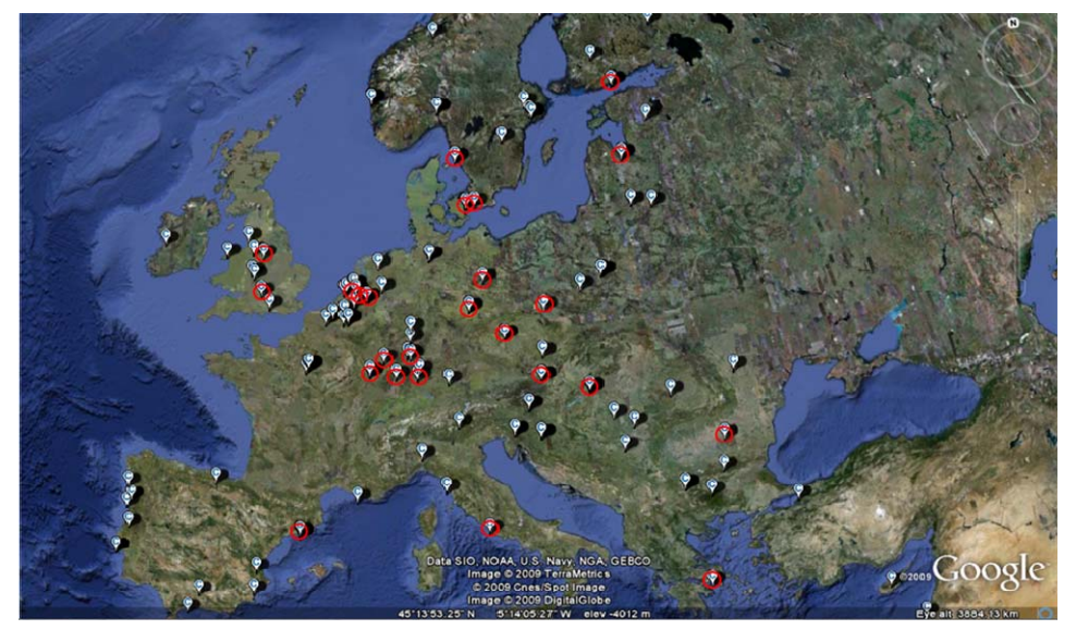
Figure 1 indicates those institutions that have indicated an interest to act as CLARIN centres.

Most of the above-mentioned criteria apply to typical centres offering resources. However, similar requirements can be established for centres offering language technology services such as those based on, for example, Natural Language Processing or Automatic Speech Recognition components. An important difference is that service centres will have to face the potentially growing interest of the future users. This issue is even more important as users from across the Humanities and Social Sciences disciplines often do not have access to computing resources and do not have enough technical skills to configure and use language tools on their own computers. Thus, service centres should guarantee an appropriate level of computing power to serve such users. For some tasks, e.g. shallow statistical semantic analyses of language in large corpora the needs for processing power can be substantial even in the case of one user performing an analysis, not to mention many users simultaneously. This issue brings in working organisational and technical aspects similar to those well known in the domain of computing centres in e.g. chemistry and physics, but it is still very seldomly discussed in the context of language technology infrastructure. Recently, a large European initiative called PARADE [21] was presented that will tackle these issues by creating a horizontal data services e-Infrastructure.