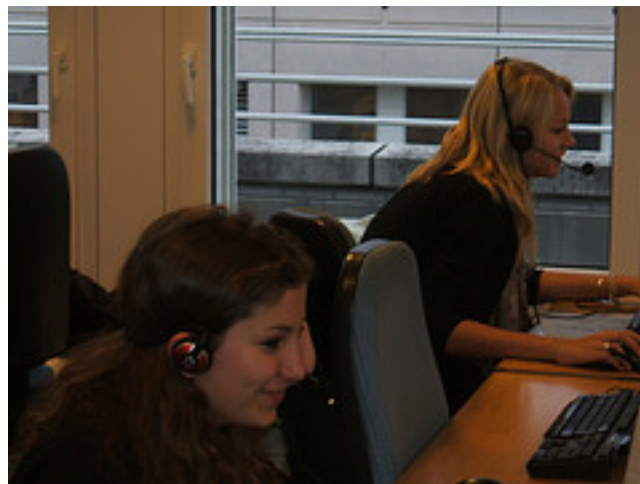
Figure 3: Two students using CALL-SLT during the Geneva University Open Week, November 2009.

We have experimented with various help strategies. There does indeed seem to be a considerable advantage in using recorded examples. Since these have all resulted in successful matches, the student can feel confident that sufficiently precise imitation of the speaker will mean that they will themselves get a successful match. This gives them a simple way to improve their fluency; they listen to a recorded example, try to imitate it, and see if the system accepts their pronunciation. If it doesn't, they keep on trying until they