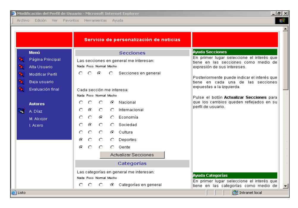
Figure 1: Editing the user model (sections)

Participation in the evaluation was requested sending mails to students and teachers from different faculties. Furthermore, any other additional spreading was permitted. Initially 104 users were registered, but 2 of them registered twice by mistake. Once into operation, 2 new users registered the first day and others 2 the third day, making a total of 106 users. Since the fourth day, users started unregistering, and the number of users suffered significant variations. Since the following day, the number of real participants each day was: 102, 104, 106, 105, 104, 102, 102, 101, 101, 100, 100, 99 and 98.