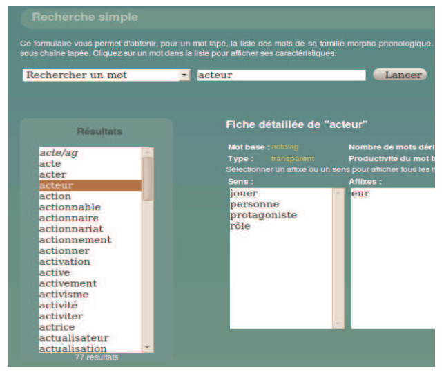
Figure 2. Result of a query for the keyword 'acteur'.

By typing a word, the resource provides the list of all the lexical units of the family; by selecting one of them in the list, the application would show the result of morphological (list of affixes) and semantic analysis (list of semantic units describing the selected lexical unit). Figure 2 illustrates the result for a query with the keyword 'acteur' (actor):