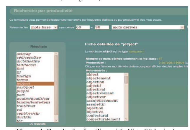
Figure 4. Results for families with 60 to 90 lexical items.

POLYMOTS can also provide information concerning the productivity of the various families. For example, it is possible to search for families containing a specific number of words or affixes appearing a specified number of times (see figure 4).