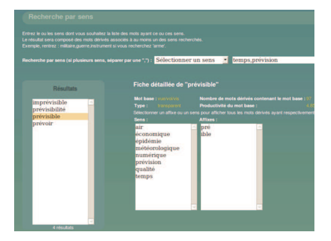
Figure 5. Result of a semantic-based query.

The set of semantic features known by POLYMOTS allows for an original way to access words. By typing words as if they were conceptual fragments, the user can access all the words in the database described by them. A family can be searched via semantic features. For example, wheather and forecast would attract most of the words of the 'see-family' (vue/voi/vis) containing the prefix 'pré'.