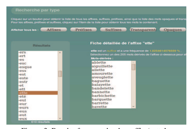
Figure 3. Result of a query by the suffix '-ette'.

POLYMOTS offers different kinds of queries, producing output in listform. If the user keyed in or selected a particular letter of the alphabet, he would get all the words starting with this letter. By selecting a stem, he would get all the stems corresponding to the selected type. Finally, if the query were by affix (figure 3: '-ette'), the user would get all the items having a particular prefix or suffix.