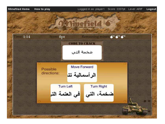
Figure 3: Minefield screenshots: what Player A sees when passing the encrypted message to Player B (on the left), and what Player B sees when choosing the decryption (on the right).