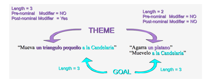
Figure 3: Annotation of two utterances in mono-clausal and bi-clausal realizations.

We perform a binary logistic regression model to predict whether speakers choose a bi-clausal over mono-clausal realization based on the following predictors: theme description length, existence of prenominal modifier, and existence of postnominal modifier.