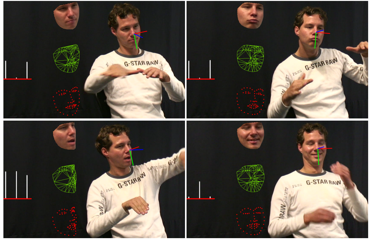
Figure 3: Facial feature extraction on the Corpus-NGT database (f.l.t.r.): three vertical lines quantify features like left eye aperture, mouth aperture, and right eye aperture; the extraction of these features is based on a fitted face model, where the orientation of this model is shown by three axis on the face: red is X, green is Y, blue is Z, origin is the nose tip.

shop on the Representation and Processing of Sign Languages: Corpora and Sign Language Technologies (CSLT), Malta, May.