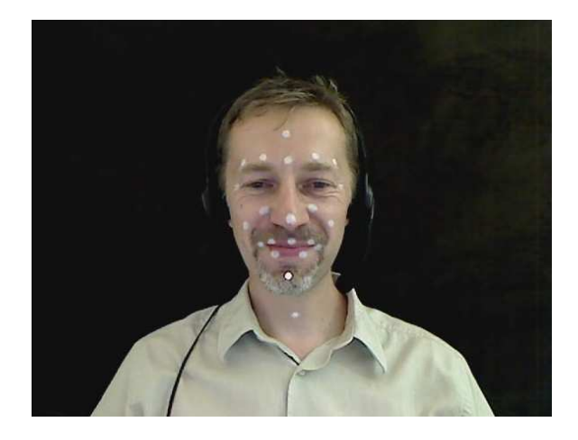
Figure 1: Markers drawn for facial motion tracking using ZignTrack