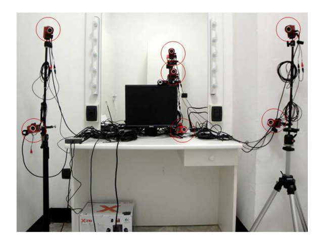
Figure 3: Desktop setup for database recording. Optitrack cameras are highlighted by circles.