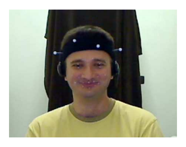
Figure 2: Infrared markers placed for facial motion tracking using OptiTrack

session, the instructor started the face motion acquisition system, left the room and the subject clapped for synchronisation with the other signals. At the end of each session, the subject was again instructed to clap, so that the instructor would enter the room and stop the face motion tracking. The microphone and webcam recorded the experiment from the beginning of the first session to the end of the third session, without interruption.