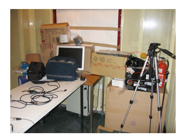
Figure 3: Positioning of the camera among the other objects in the recording room.

earlier than their friends. During this interview, FT informed the confederates that it was their responsibility to elicit natural speech from their friends, by raising appropriate topics whenever the conversation seemed to approach a dead end. In order to maximize the amount of recorded speech from the speakers, they were instructed not to monopolize the conversation. They were also informed that the conversation would be filmed, and where to sit so that only the other participants would appear in the film. Importantly, they were asked not to unveil any of these details to their friends until the end of the recording, and to pretend that they had never met FT. Finally, they were briefly instructed about the activity planned for the third part of the recording (see below for details).