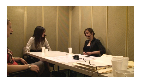
Figure 2: Snapshot extracted from one of the films in the corpus.

The speakers were recorded on a Edirol R-09 solid-state stereo recorder. Each speaker was recorded in a separate channel. The confederate was directly recorded on a computer via a dedicated sound card. All participants wore a Samson QV head-mounted unidirectional microphone. The microphones were placed at an average distance of 5 cm from the left corner of the speakers' lips. The sampling rate used was 44.1 KHz, and quantization was set to 32 bits.