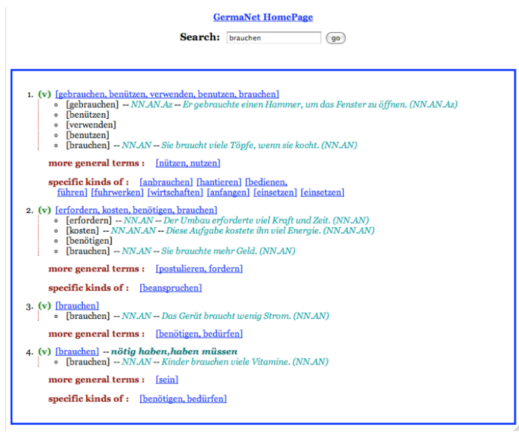
Figure 4: The GermaNet solution

Buldialects project, but also analysis data like matrices and topographic maps of the Bulgarian dialect distribution. The availability of electronic publications around the Bulgarian dialects will complete this eSciDoc solution.