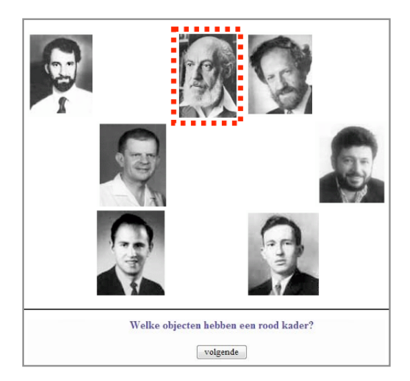
Figure 1: A trial in the people domain.

A first manipulation of the target properties was that trials occurred in two different types of domains: The furniture domain and the people domain. For an example of a trial in the people domain, see figure 1.