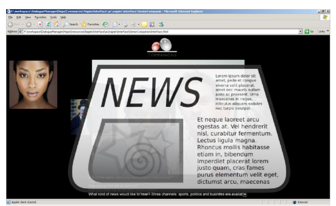
Figure 1c: Senior Companion news reading screenshot

The Senior Companion is a multimodal dialogue system for discussing information about the users life in a natural way through photographs. Although we are aiming to discuss a broader range of topics later in the project, to begin we have identified a basic selection of topics that will allow the system to engage in a lively dialogue and establish a platform for reasoning about user information. The initial topics we have selected for engaging in a dialogue about a user's photographs are: the location of photograph, when the photo was taken and for what occasion and the names and ages of the people in the photos as well as their relationship to the user and to each other. Not surprisingly, the key information for each of the topics mentioned includes Named Entities: Person Names, Locations, Dates/Times, People Relationships, etc. Based on this, we have chosen an Information Extraction approach to recognize and extract such information from the user's utterance which is explained in more detail in the following sections of this paper. Figure 2 contains a very simple user session taken from an early version of the demonstrator.