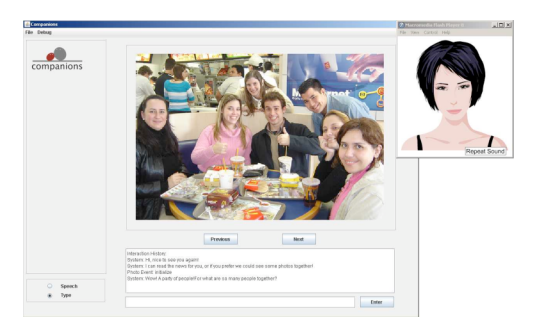
Figure 1a: Senior Companion screenshot version 1

The construction of an enjoyable and cohesive interaction between the user and the computer in the Senior Companion sets the scene for advanced multimodal dialogue research and in particular the research discussed in this paper.