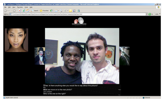
Figure 1b: Senior Companion screenshot version 2