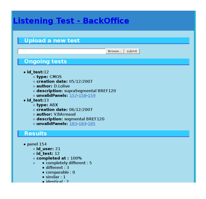
Figure 2: The tester can monitor ongoing tests and create new test instances