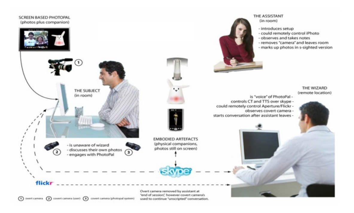
Figure 1: The WOZ1 setup used to collect data