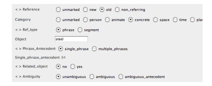
Figure 1: Attributes (partial screenshot)

The current composition of the corpus is summarized in Table 1. It is expected that the final version of the corpus will also include half of the texts in the RST discourse treebank, as well as the files from the Vieira-Poesio corpus and the previously annotated files in the GNOME corpus.