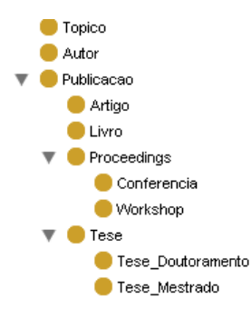
Figure 2: Portuguese source ontology.

Consider the ontologies shown in Figures 2 and 3, in English and Portuguese languages, respectively. We exemplified as the terms "Topico" in the source ontology is mapped to the term "Subject" in the target ontology. These terms represent the research areas related to a publication.