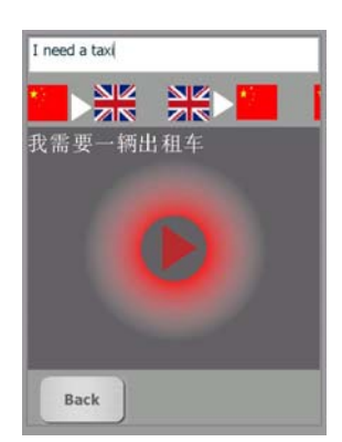
Figure 2: Free textual translation on mobile device

Furthermore, the transearly service is also useful for computational linguistic lectures because of big coverage of language pairs. Our current system supports more than 15 language pairs.