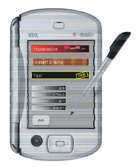
Figure 1: COMPASS Service Client

Smart dining and taxi talk combine multilingual generation with phrasebook translation. Resc you combines phrasebook translation with a free general text translation for selected situations. Transearly combines phrasebook translation with free text translation. We argue, why the respective demands and constraints of each of the four services are met by the selected combinations of approaches. All these services can be called by user requests and one service can call another service, for example, the smart dining service can access the transearly service too.