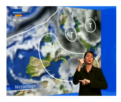
Figure 1: Example of the Phoenix corpus video data

The German television channel Phoenix broadcasts the daily news show Tagesschau in German and DGS. The DGS translation is provided by an interpreter who is shown in the lower right corner of the TV frame. The interpreter is changing daily. In total there are eight interpreters, some signing in different dialects of DGS, responsible for the translation of the news. Figure 1 gives an example image.