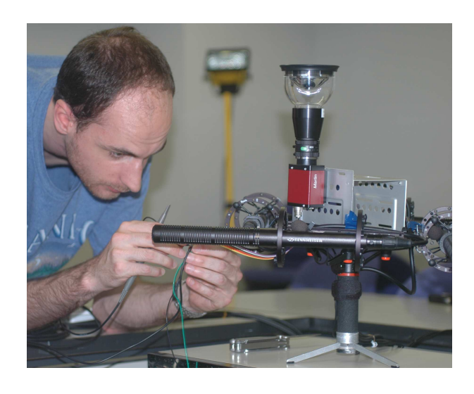
Figure 1: A 360-degree camera surrounded by a ring of microphones provides a view of all participants at the meeting

The small 360-degree video camera is placed in the centre of the meeting table above a ring of directional microphones, in a windmill configuration, to collect a stream of audio-visual information from which to characterise the discourse events of the meeting. The video signal is of relatively low resolution (see figures 3 and 4), so fine details such as eye-gaze and direction are not available to the system in its present design (and will perhaps not be necessary). Instead, gross movements are detected from the skin tone areas and, from these, a set of primitive features de-