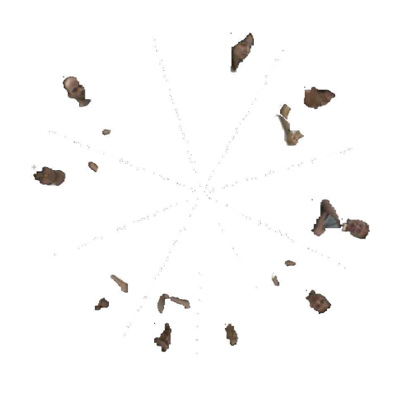
Figure 4: The 360-degree view after skin-tone detection. These are the moving parts that we track

variations in overall sound quality around the table. From this information, in conjunction with the video primitives, we are attempting to produce an estimate of each speaker's activity throughout the meeting.