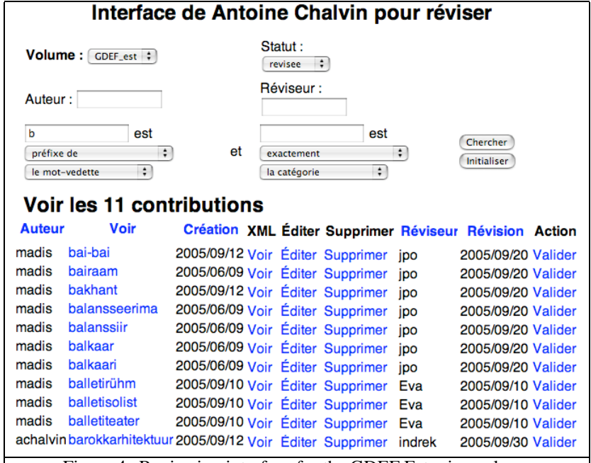
Figure 4: Reviewing interface for the GDEF Estonian volume