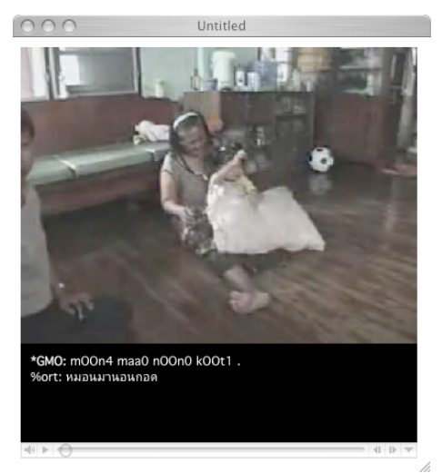
Figure 3: A SMIL frame in a Thai interaction