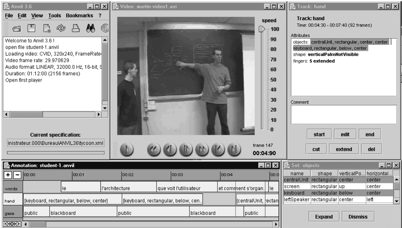
Figure 4: Screenshot of the annotated example. The annotation scheme (lower left window) contains 3 tracks (spoken words, hand gestures, gaze). The new Anvil features enables the annotation of objects referred in gesture and speech (lower right window).

Spoken words have been manually annotated using the PRAAT 3 tool and imported in Anvil. Gaze and hand gestures have been manually coded in Anvil. Using Anvil's graphical user interface during the annotation process, hand annotations have been linked to elements of the object set (Figure 5).