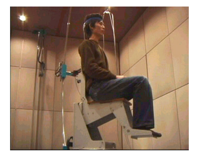
Figure 5: HRTF recording system

To collect a speech corpus from young children, we have made special software to keep children's attention. The software is based on a quiz game, and the answer of the quiz is the intended speech. The subjects consist of about 300 children ages from 6 to 12. Each subject has read 30 words, 30 sentences from fairy tale, and 21 command voices. The recording time is about 20 minutes for each subject.