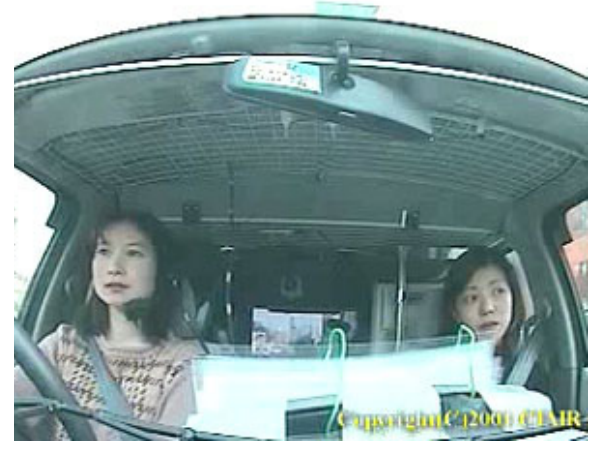
Figure 1: Dialog Recording

The number of subjects is currently about 800, total recording time is over 600 hours and total corpus size is