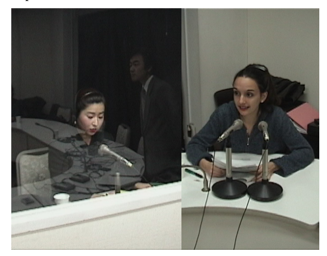
Figure 6: Simultaneous Interpretation

We have collected a total of about 70 hours of speech data and transcribed them into ASCII text files. The database consists of wave files, transcription files, and environment data files and contains about 626,000 morphemes in 66,500 utterance units.