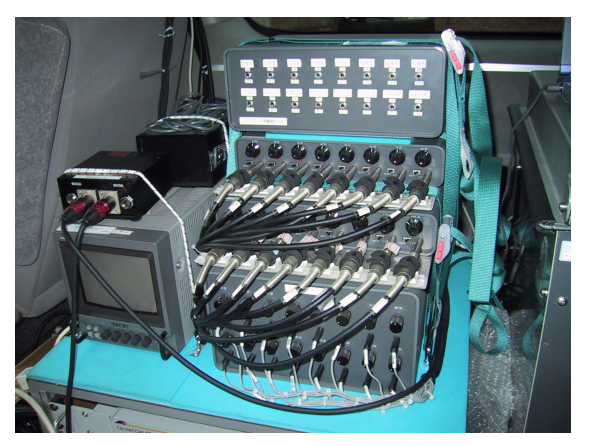
Figure 4: Microphone Amplifier

Three other PCs are used for recording video images of the driver's face, the conversational situation and the road view respectively. These images are coded into the MPEG1 format. The remaining two PCs are used for controlling the experiment. The multimedia data on all the systems is recorded synchronously. The total amount of the data is about 3 GB for about a 60-minute drive.