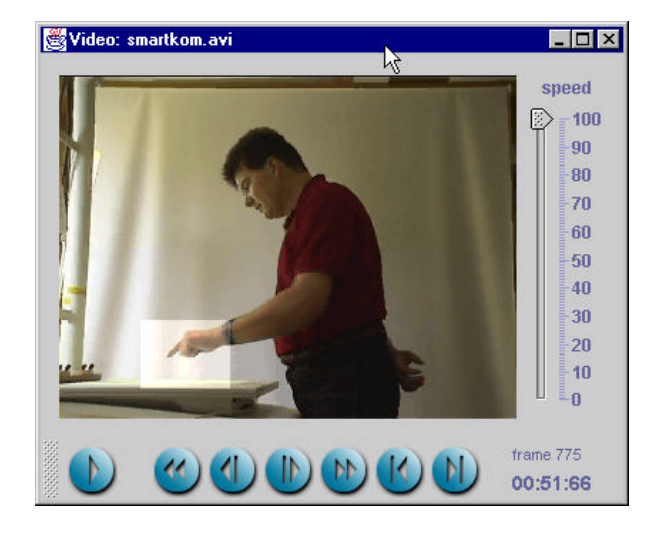
Figure 3: The video annotation plug-in

The second plug-in currently realized in Anvil is used to insert mark-up information directly into the video data. The user can link each annotation tag with a tag in the video stream (see Figure 3). A gesture's main stroke is marked with a highlighted rectangle.