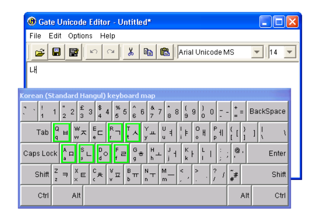
Figure 3: The GUK Unicode editor using a Korean virtual keyboard.

The IMs defined by GUK provide support for text input by means of virtual keyboards. Because of restrictions imposed by the platform independent manner in which Java treats the input hardware, there is no reliable way to determine the actual layout of the physical system keyboard: only the characters generated by a key stroke (e.g "E") can be obtained but not the actual position of the pressed key (e.g. third from the left in the top row of keys). The virtual keyboards defined in GUK are based on the assumption that the system keyboard uses a British layout which could cause some keys to be misplaced when the system keyboard