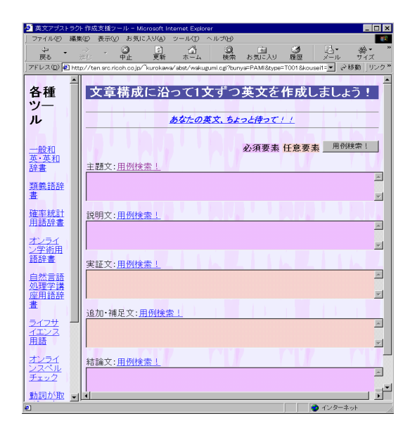
Fig. 2: A Rhetorical Template Retrieved

The next step to be taken is to try to produce each component sentence by freely using our "Sample Sentence Search," "On-Line Lexical Look-Up/Spelling Check," and "Sentence Pattern Search" (under construction) functions. Two kinds of "Sample Sentence Search" are possible with the "BEAR." One is driven by a sentence role and the other by a keyword in English or in Japanese.