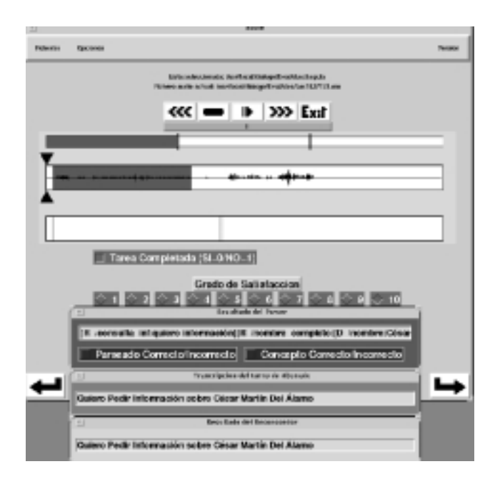
Figure 2: ULAT Annotation Graphic Interface

The inputs to the ULAT tool are: a recorded audio file of the dialogue, a log file provide by the system and an external information file (questionnaires). Figure 2 is a view of the graphic interface of the ULAT tool and shows all the information of a user turn. The annotator only has to mark a section of the speech wave, corresponding to a turn, listen to it and check if the information that the ULAT tool has presented for the turn is correct. The beginning and end samples are obtained by the tool and recorded automatically in the output file. Additional features of the ULAT tool are: